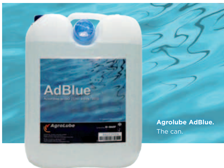
Agrolube AdBlue. The can.

Detailed chemical analyses of each individual product lot guarantee the best efficiency and preservation of the exhaust gas abatement system, as established by the Argo Tractors directives. ■