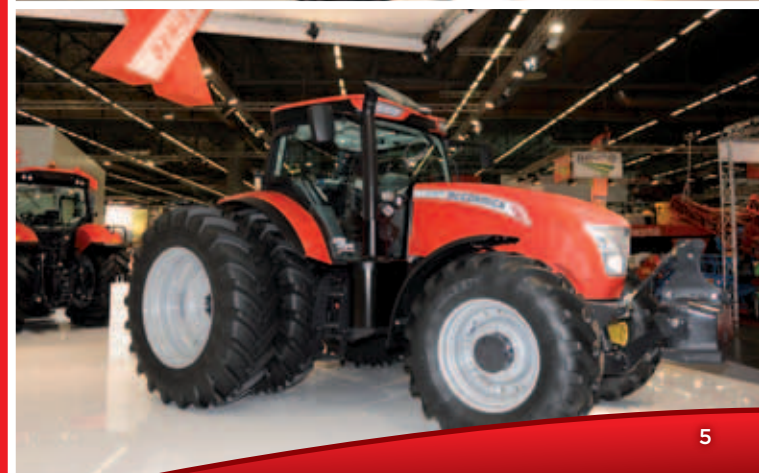
X7. The range is officially presented at Sima.