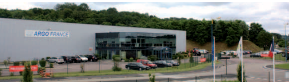
St Dizier. The new Argo France headquarters.

The spare parts warehouse stocks over 30 thousand articles and ensures an ultra-efficient, prompt and widespread domestic and international service.