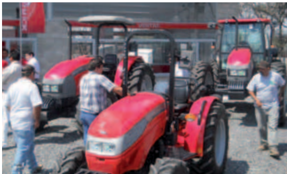
Celaya. McCormick tractors lined up in front of the new agency, Euroequipos Agroindustriales.