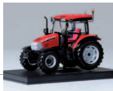
P.N. PRO0536. The new McCormick X60.50 scale model.

After a long period during which all the McCormick fans waited with bated breath, the new scale model of the prestigious X60.50 is now a reality. The 1:32 scale model realistically portrays the innovative McCormick tractor in great detail and can be purchased from all McCormick concessionaires. You’ll find a complete list in the Argo Tractors website: www.argotracors.com