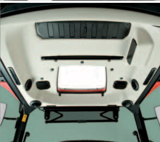
Cab interior. Particularly high-level comfort for the new X50 tractors.

This means that the effective power supplied to the PTO increases from 88 to 95 HP in model X50.20, from 95 to 102 HP in model X50.30 and from 105 to 113 HP in model X50.40.