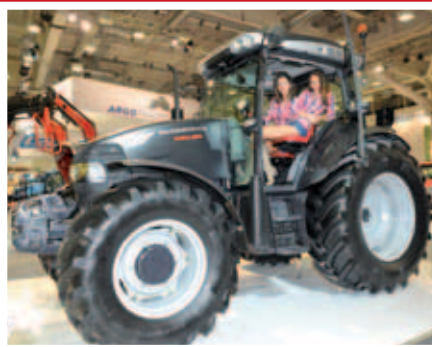
X60. The special versions of the range, one painted orange and the other, “X-Black” model.