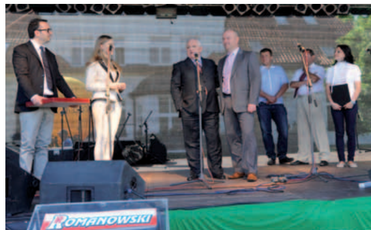
Sulowo. Presentation of the commemorative plate to mark 10 years of collaboration with Romanowski.

Last year, the importer more than doubled the number of McCormick concessionaires, which rose from 20 to over 40.