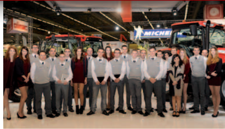
Sima 2013. The entire staff of Argo France.

The controls are arranged in a rational layout, while other characteristics include the tilt-and-telescopic steering wheel, the new integrated instrument panel, the new multifunction armrest with,