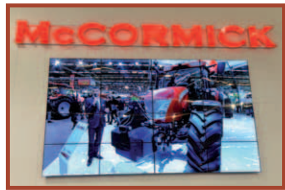
Paris. The big screen in the stand.

rate, common to all models, up to 6 rear control valves and an electronically controlled rear power lift with 9,300 kg lifting capacity. The 4-speed electro-hydraulically controlled rear PTO is standard equipment on all models, while the electronically controlled front PTO and power lift with 3,500 kg lifting capacity are available on request.