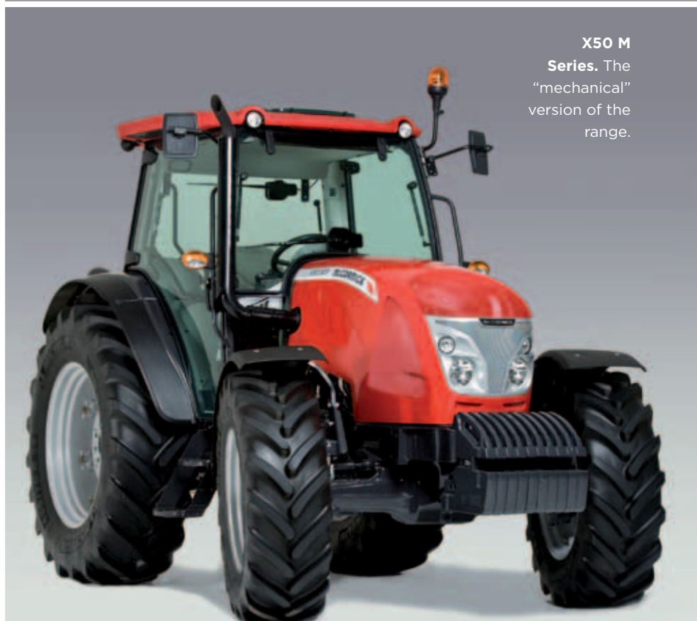
X50 M Series. The “mechanical” version of the range.

McCormick's X50M Series, where the letter M stands for mechanical, is mainly designed for the European market. The three X50M models feature Tier 4 Interim engines with 85 to 102 HP power ratings, a mechanical reverse shuttle, overdrive (24-12) as part of the standard equipment and an additional optional creeper (32+16), 4WD engagement with the Spring On system, power assisted mechanical PTO and rear power lift controlled by the E.L.S. Ergonomic Lift System.