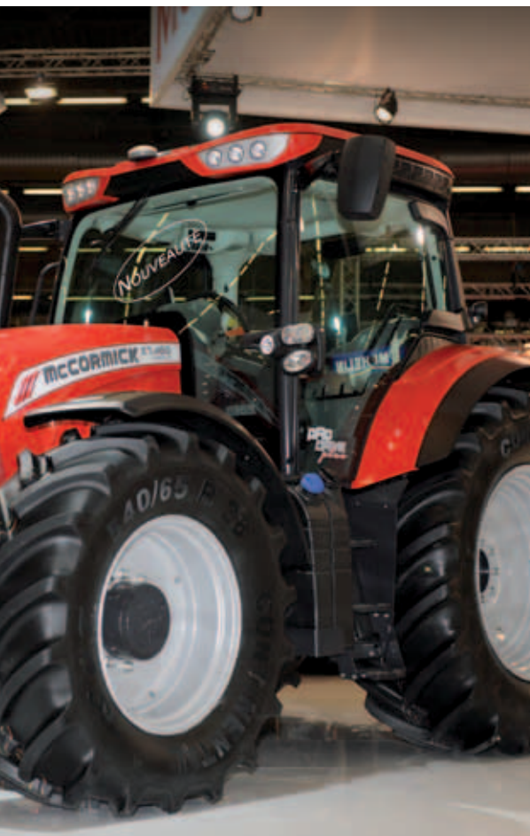
X7. The new tractor is revealed.

Lastly, the McCormick X50 and X50M Series were also on show at the Paris fair having already been presented at Eima, as had the X-Black and “orange” versions of the X60 . ■