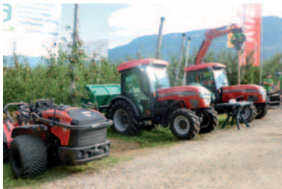
Irsara. McCormick specialized tractors among crop rows at the event.

Each year, an increasing number of Italian and foreign exhibitors and visitors take part in the event, which is always a great success.